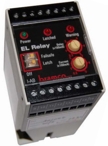
I-AB Enclosure Dimensions